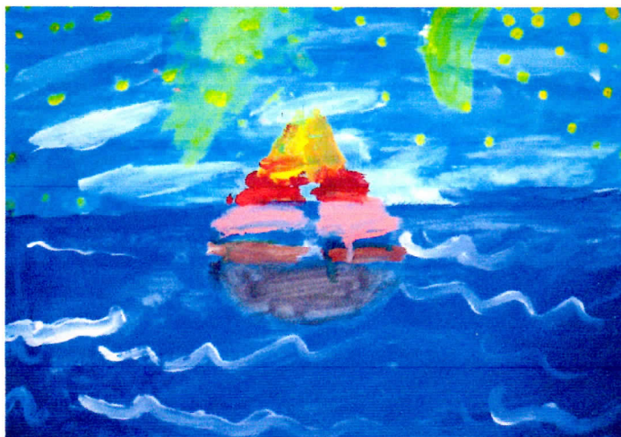
Drawing by a child living in SOS Children's Villages

Dear President, Dear Members, Dear friends and supporters,